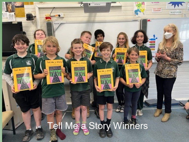
Tell Me a Story Winners

A great place to be, a great place to learn