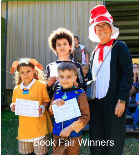
Book Fair Winners