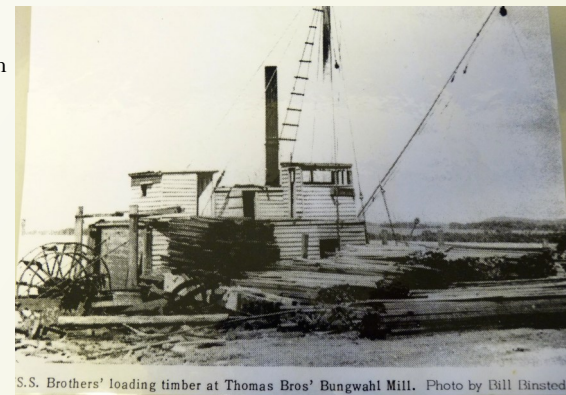
S.S. Brothers' loading timber at Thomas Bros' Bungwahl Mill.